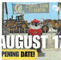
The opening date for Buc-ee's in Benton is...