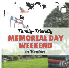
Looking for a fun family adventure clos...