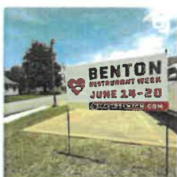
Spotted! Have you noticed these signs...