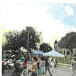
We had a great time last night at Downto...