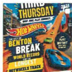
The next Downtown Benton's Third...