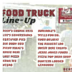
Downtown Benton's Third Thursday is ON...