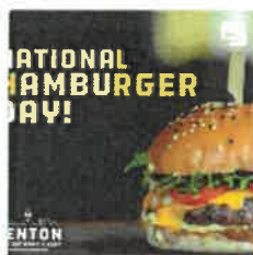
It's National Hamburger Day! Wh...