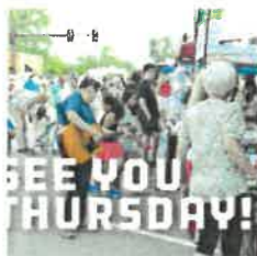
Downtown Benton's Third Thursday is...